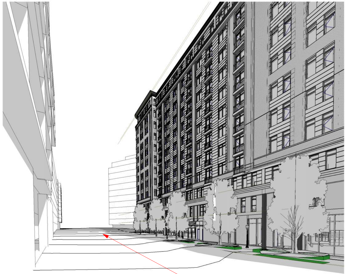
2 Persp From Florida Ave Looking East.