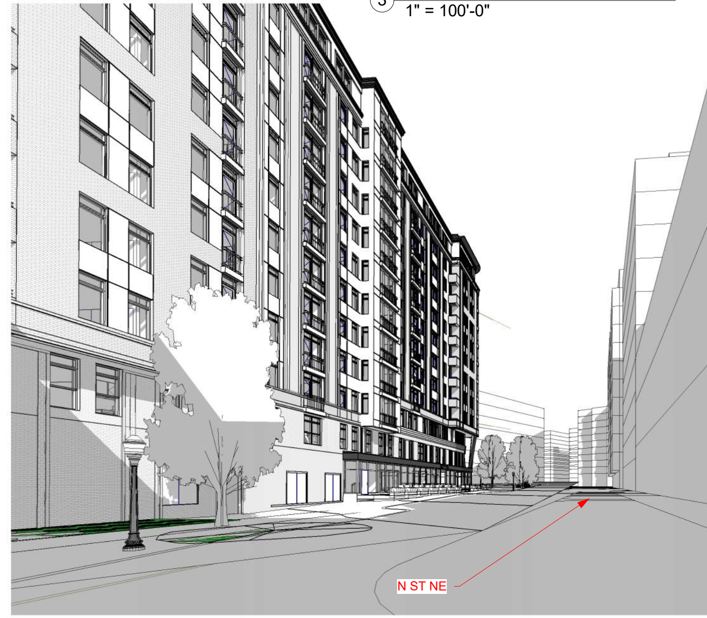
1 Persp From N Street Looking East