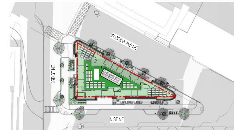
3 VIGNETTES FOURTH KEY PLAN 1" = 100'-0"